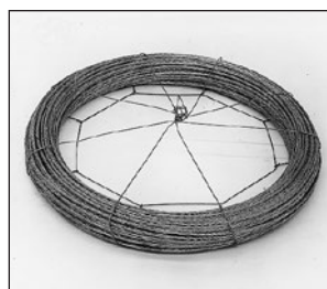
3. Twist at least two inches of the legs together until the wire cage is tight.