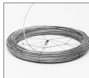
4. Turn the wire cage over and pay-out from the open side. Tuck the end back into the cage.