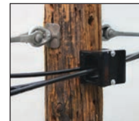
Uni-Group Cable Guide