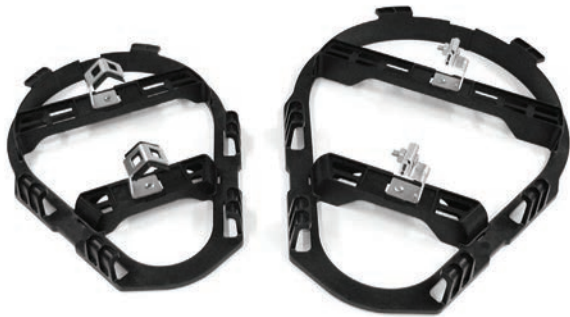
12" and 16" Bracket Sizes