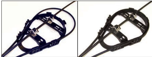
Captures cable loop