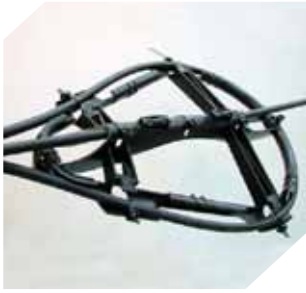
18" – 20" Cable Loop