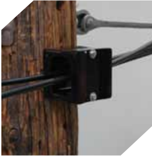
Uni-Group Cable Guide