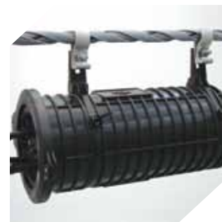
COYOTE Dome Bracket Kit