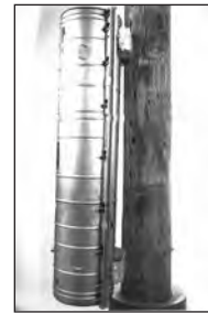
Vertical Mounting Bracket 8003472