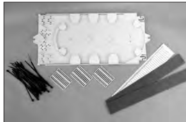
Low Profile COYOTE Splice Tray