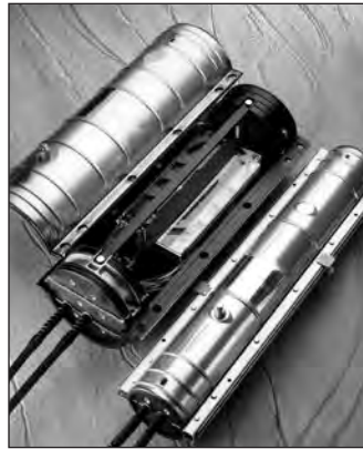
COYOTE Splice Case