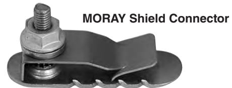
MORAY Shield Connector