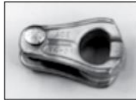
TC-5F Thimble Clevis (Code C1)

Dielectric Dead-ends can be banded to concrete or steel structures using the 12Klb Banding Bracket Kit (Cat. #710010745, code B1). The kit includes a 5/8"-11x2" long bolt, lockwasher, hex nut and banding bracket. This connects to the Extension Link with 5/8" eye nut referenced above (Cat #71002366). The bracket is rated for 12,000# (53 kN) and should be used with two high strength 1-1/4" steel bands (not supplied).