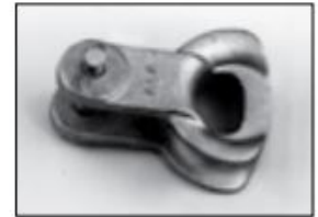
ATC-20M Thimble Clevis (Code C2)