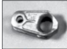
TC-6F Thimble Clevis (Code C4)