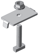
Mid Clamp w/RAD™ Bolt