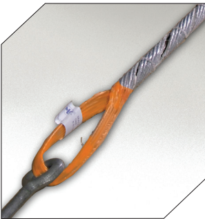
BRACE-GRIP® Dead-end systems for Rod