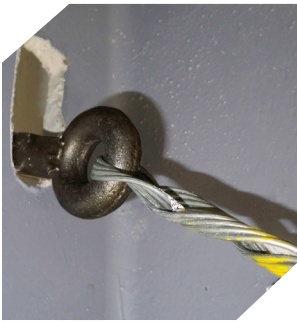
BRACE-GRIP® Dead-end systems for Strand