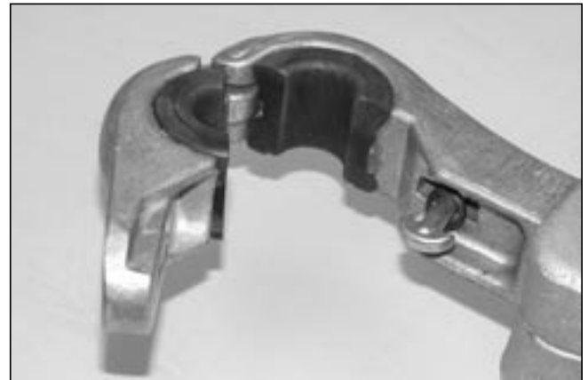
FIGURE 3 - KEEPER IN OPEN POSITION