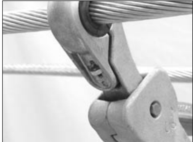
FIGURE 5 - POSITION SPACER DAMPER ON CONDUCTOR