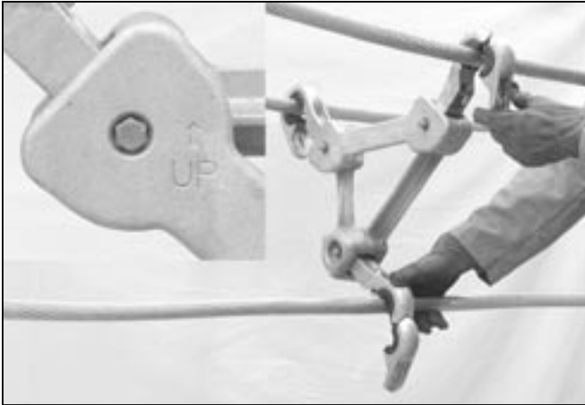
FIGURE 4 - POSITION SPACER DAMPER ON CONDUCTOR

2.01 Position Spacer Damper on conductors noting the orientation (up arrow) molded on the frame. Be sure that the Spacer Damper sits squarely on each conductor. (Figure 4)