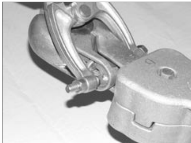
FIGURE 2 - POSITION INSTALLATION TOOL

NOTE: Be sure that the adjustment of the tool will allow sufficient movement of the keeper to allow the toggle pin to be rotated.