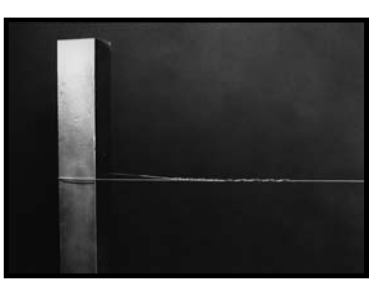
Step #5 Completed application of the VINE-LINE Connector on a stake.