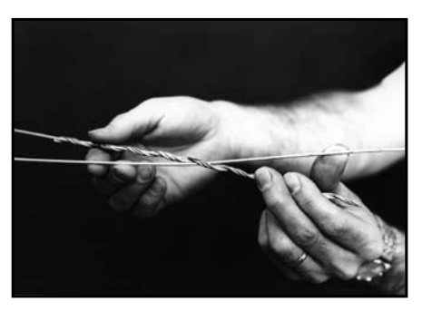
Step #3 Pull the Connector and wire until the wire is tight, and wrap the other half of the Connector onto the wire.

Step #2 After the wire is wrapped around a stake or pulled through a dead-end, start applying the Connector to the tail end of the wire. Be sure to start the application at the center mark on the Connector.