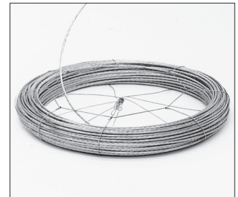
4. Turn the wire cage over and pay-out from the open side. Tuck the end back into the cage.