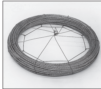
3. Twist at least two inches of the legs together until the wire cage is tight.