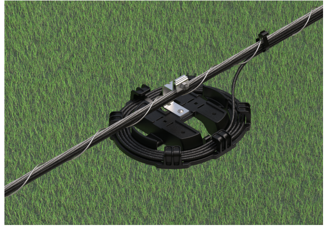
SLACKLOOP Drop Cable Storage Bracket Mounted on Messenger