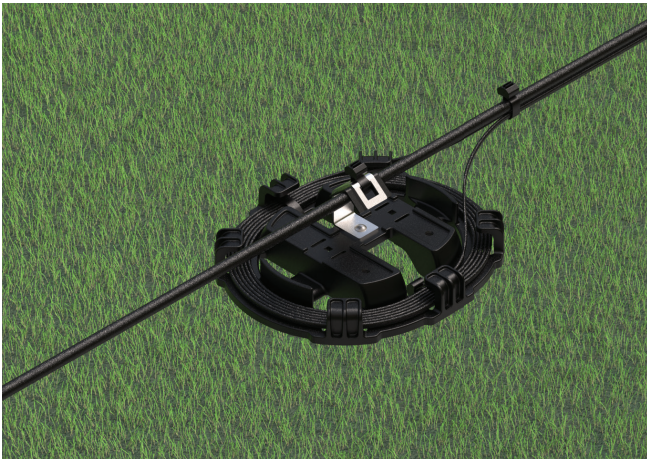
SLACKLOOP® Drop Cable Storage Bracket Mounted on ADSS Cable