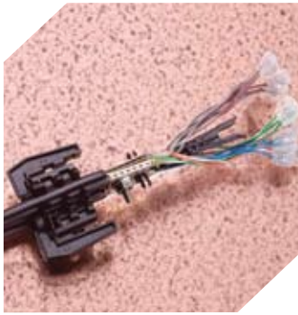
Cap, Bond Connector and Splices