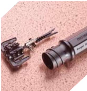
Vial and Cap