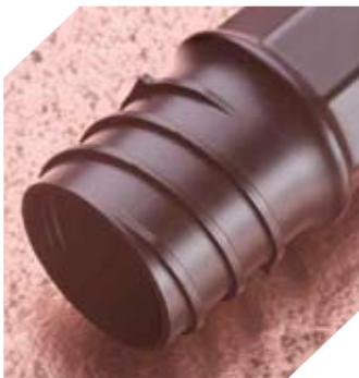
Cap Thread Locking Feature