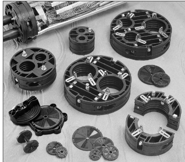
ARMADILLO Sealing Washer End Plates

When selecting an end plate, the ARMADILLO Sealing Washer End Plate may be used for most OSP applications that do not require more than one, two or three cable entry ports. End plates feature a fixed number of entry ports that do not require a power source or major tooling for field drilling and are designed to maintain 10 psi. This design also utilizes Mastic sealing tapes that do not require the use of C-Cement and allow the end plates to be re-used.