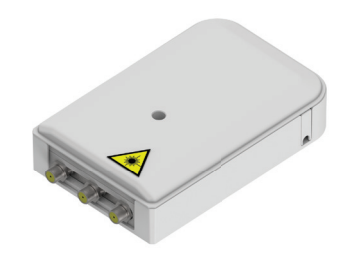
COYOTE ACE Equipped with – (1) CAT6 Connector and (1) Coax Splitter

COYOTE ACE Equipped with - (1) Coax Splitter