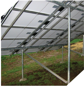
Underside of large ground mount