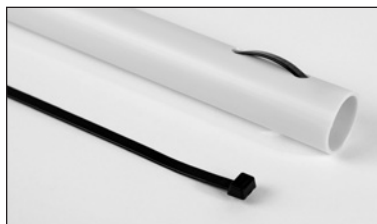
Universal Cable Tie

Note: For different lengths, attachments, and/or the addition of reflective tape, contact your PLP representative or Preformed Line Products.