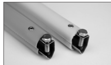
Stainless Steel Clamp