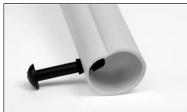
LOOP LOCK® Pin (LLP)