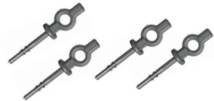
Round Eye Lock Pins - RPP-0840