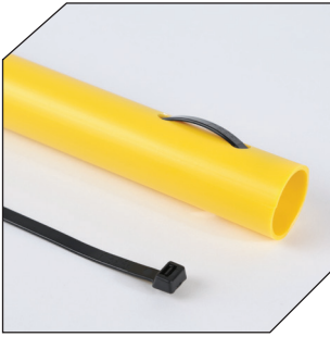
Universal Cable Tie (UCT)