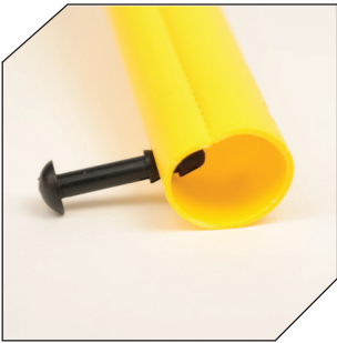
LOOP LOCK® Pin (LLP)