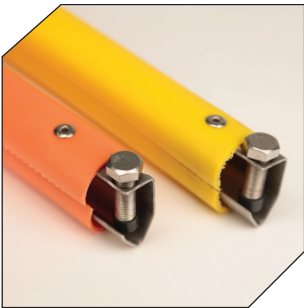
Stainless Steel Clamp (SC)