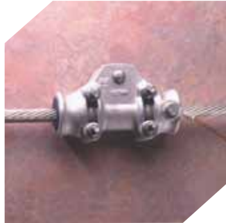
FIBERLIGN® Cushion Clamp for OPGW

Since 1998, the cushion concept has been field proven with the FIBERLIGN® Cushion Clamp for OPGW and the CUSHION-GRIP Clamp for T-2 conductors. Both of these PLP products have had broad industry usage and acceptance.