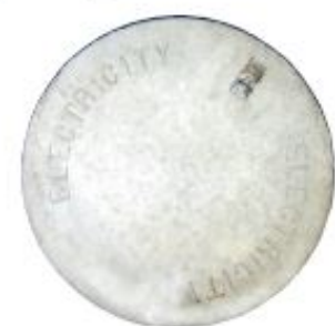
Applicable for Lid part numbers only